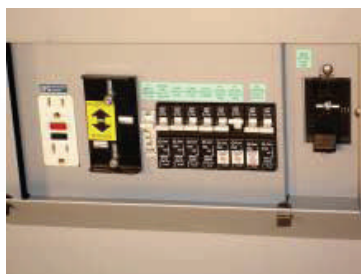
Integrated Sub Panel