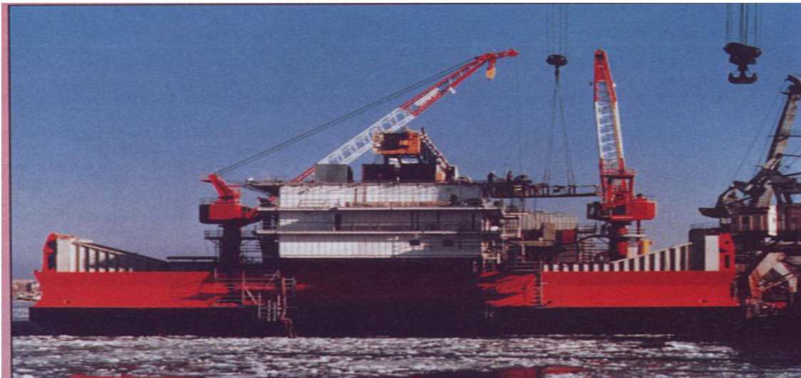
Operating Rig 257 Caspian Sea